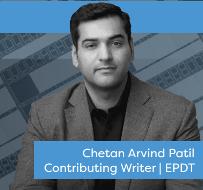
Chetan Arvind Patil Contributing Writer | EPDT